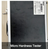
Micro Hardness Tester