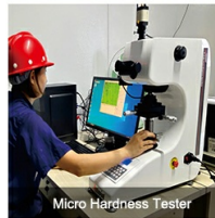
Micro Hardness Tester