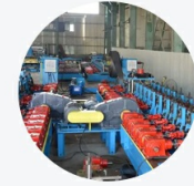
4 Cold Working