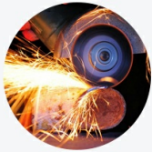
5 Length Cutting