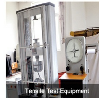
Tensile Test Equipment