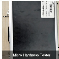
Micro Hardness Tester