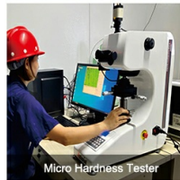
Micro Hardness Tester