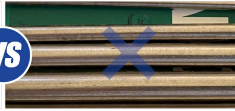
Product Surface Rust