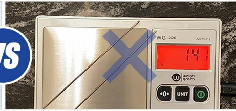
Product Weight Does Not Match