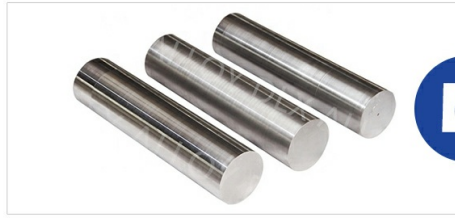
Smooth And Shiny Surface