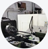
6 Surface Treatment