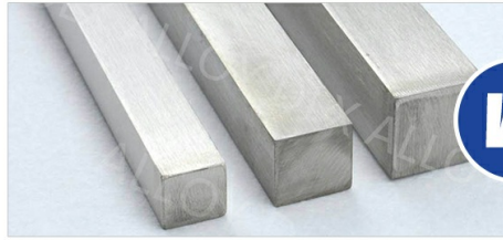
Product Quality Strict Inspection