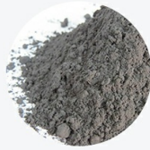
1 Raw Material

The production process and technology used in the product