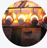
3 Thermal Processing