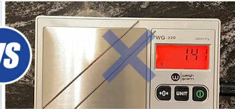
Product Weight Does Not Match